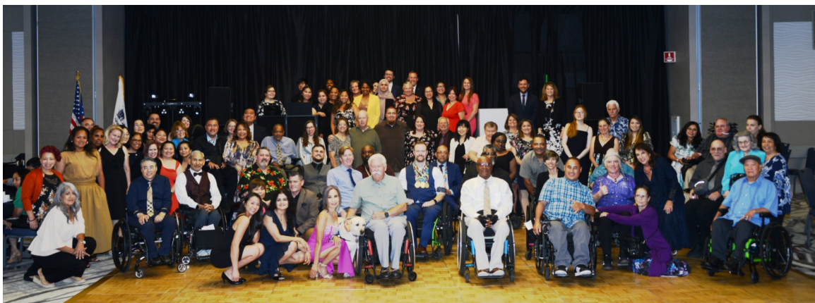
PVA Banquet August 10, 2024