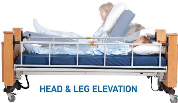
HEAD & LEG ELEVATION